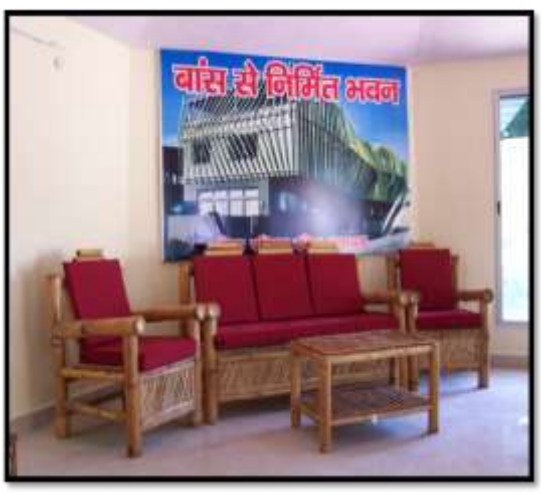
Bamboo's Sofa Set